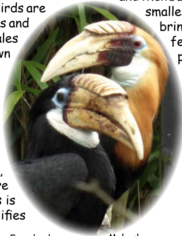
Female shown bottom left.

The Hornbill's beak, which can reach up to 10 inches in length, is topped with a large, hollow structure called a casque, this is decorative and amplifies its calls.